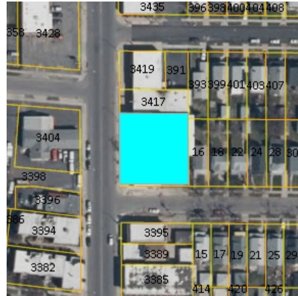
Parcel Detail Map