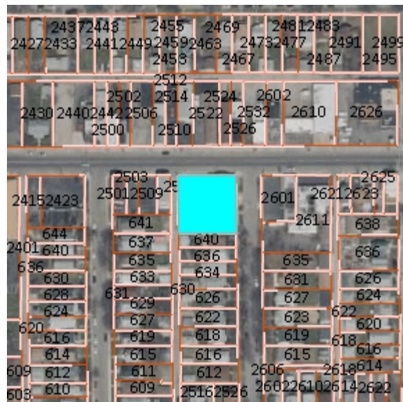
Parcel Detail Map