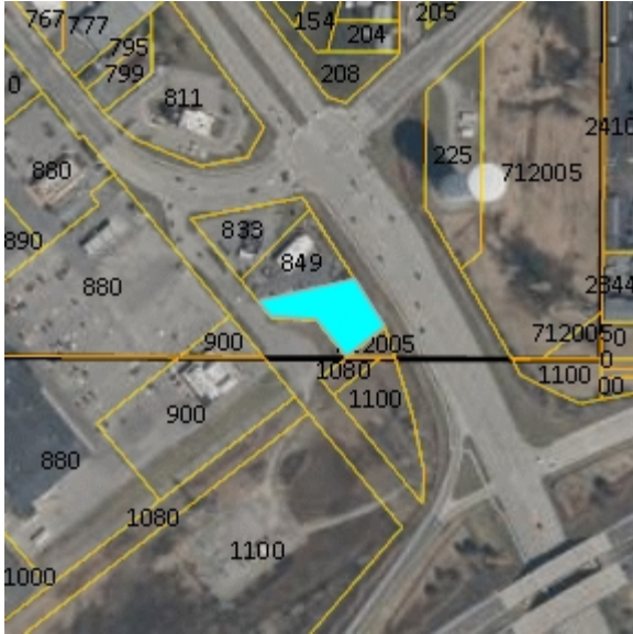
Parcel Overview Map